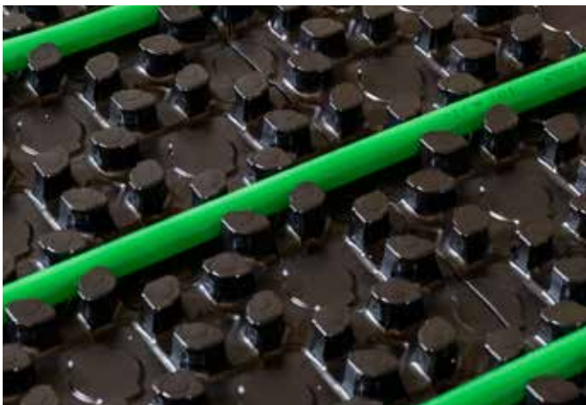
top-Nopp® nub system