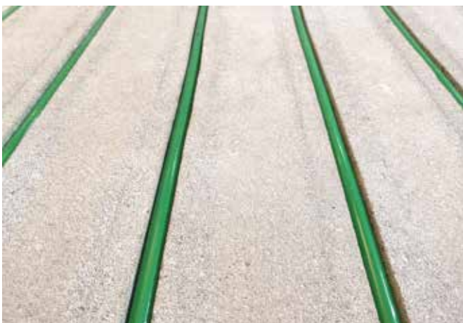
CUT-THERM® milling system