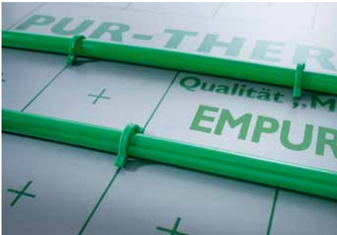
PUR-THERM® stapler system