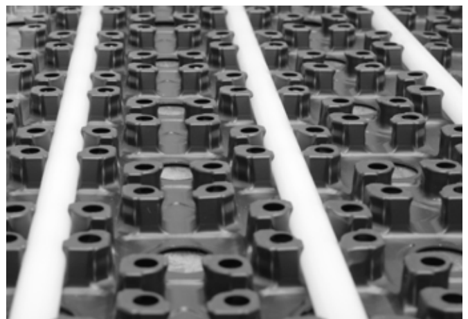
top-Nopp® mini nub system